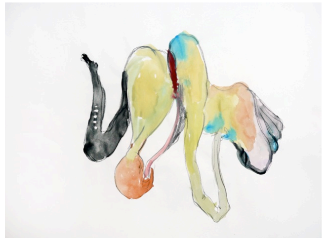
[IMAGE: Naotaka Hiro] Left: Bathroom drawings, courtesy of the artist. Right: Drawing sample